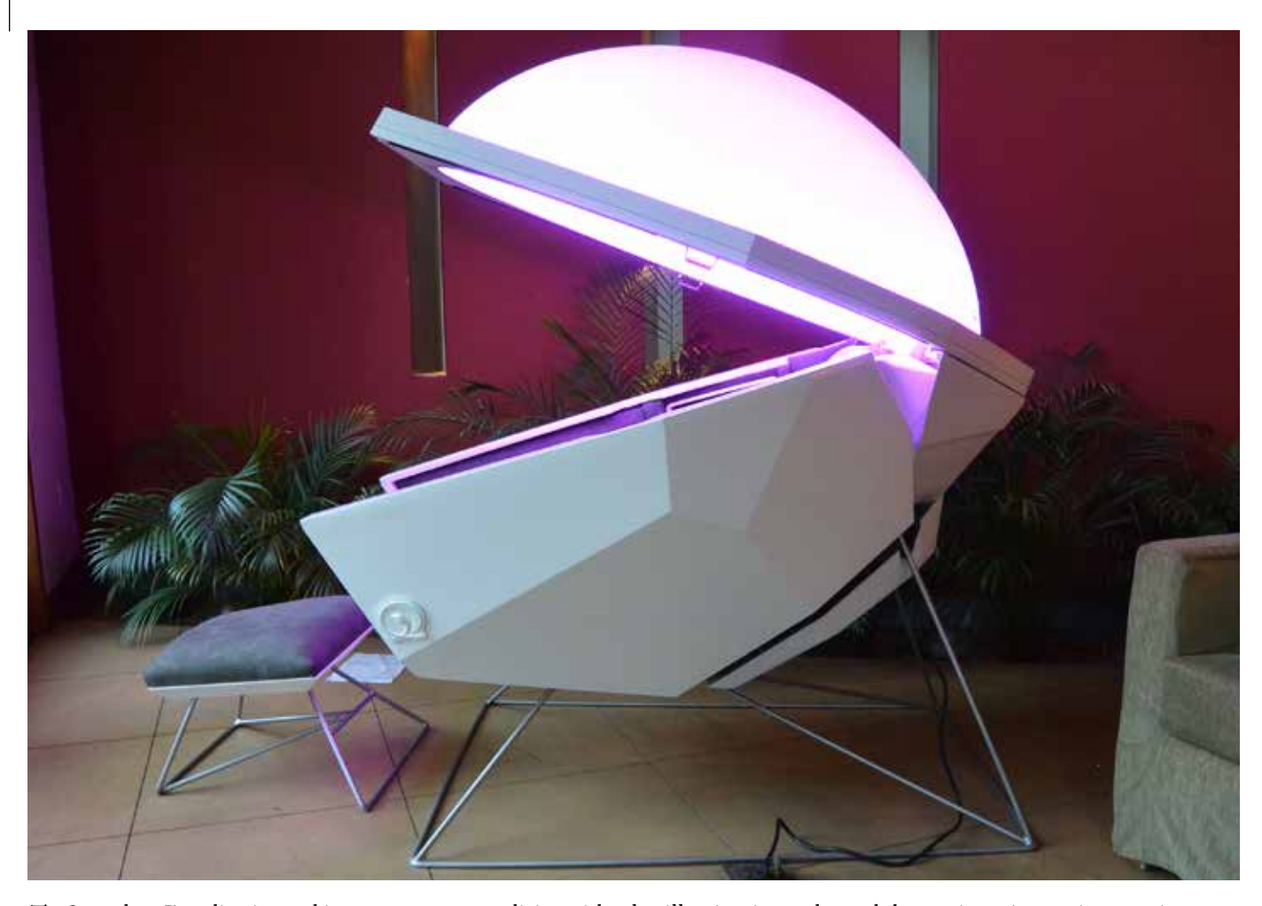
The Somadome<sup>™</sup> meditation pod integrates energy medicine with color, illumination and sound therapy in an immersive experience designed to improve the user's mood and well-being.

tion not afford to invest in these services? There's a lot of competition. To stay competitive, you have to figure out how to make this work.